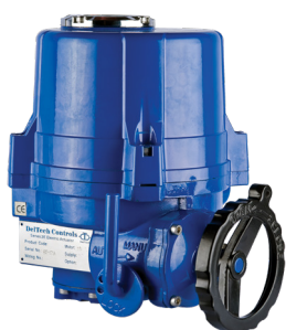
◀ Series 2E Electric Actuator