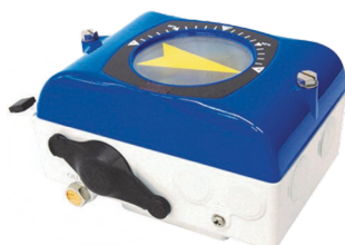
◀ Series 87 Positioner