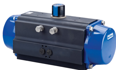
◀ Series 21 Pneumatic Rack & Pinion