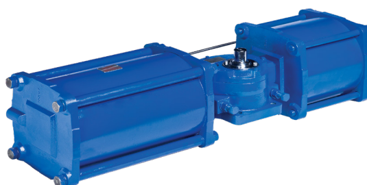
◀ Series 25 Pneumatic Scotch Yoke