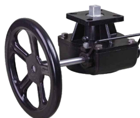
◀ Series 12 Manual Override