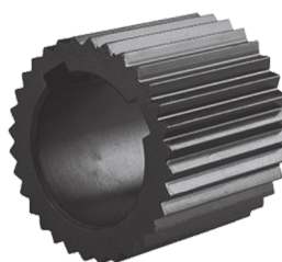
◀ Series 92/93 Insert