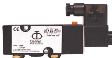
◀ Series 85 Solenoid Valve