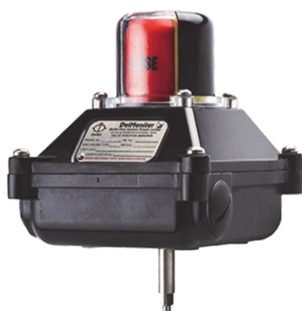
◀ Series 83 Limit Switch Box Weather Proof / Flame Proof